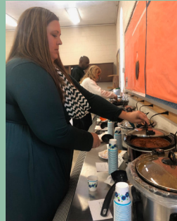
Left: Some of the chili's that entered the competition and a teacher enjoying it.