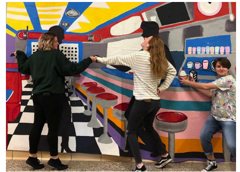
Above: The stage tech poses with a Grease -inspired mural.